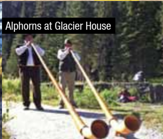
Alphorns at Glacier House