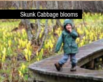
Skunk Cabbage blooms