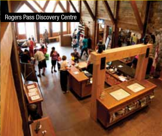
Rogers Pass Discovery Centre