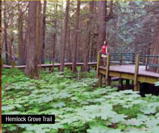
Hemlock Grove Trail

Trans-Canada Hwy, 2 min east of the main Revelstoke exit Drive 26 km from the valley to the subalpine meadows at the summit of Mount Revelstoke. Enjoy spectacular mountain views on a dozen hiking and walking trails.