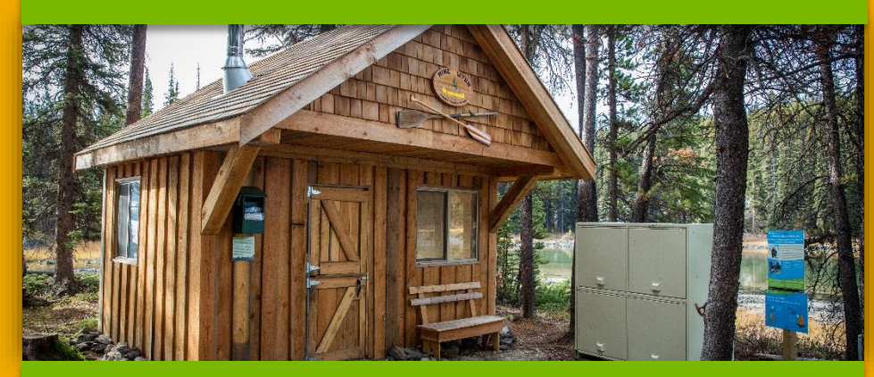
Opened a new introductory wilderness campground at Maligne Lake and made numerous improvements to Jasper National Park's trail network.