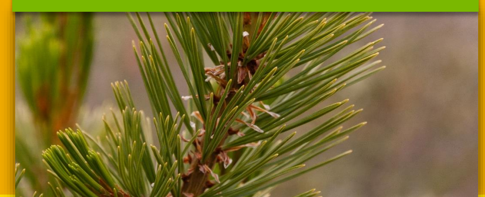
Protected critical habitat for southern mountain caribou and laid the groundwork to recover other species at risk like whitebark pine and bats.