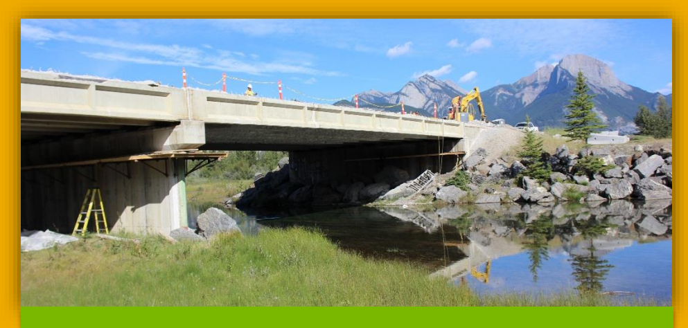
Received Federal Infrastructure funding to rejuvenate roads, bridges, signs, campgrounds, picnic areas, trails, heritage buildings and other critical infrastructure.

Parks Canada reports annually on the implementation of the Jasper National Park Management Plan . The Management Plan guides our work to protect and present nationally significant natural and cultural heritage in Jasper National Park. Here are some highlights of that work from September 2014 to September 2015.