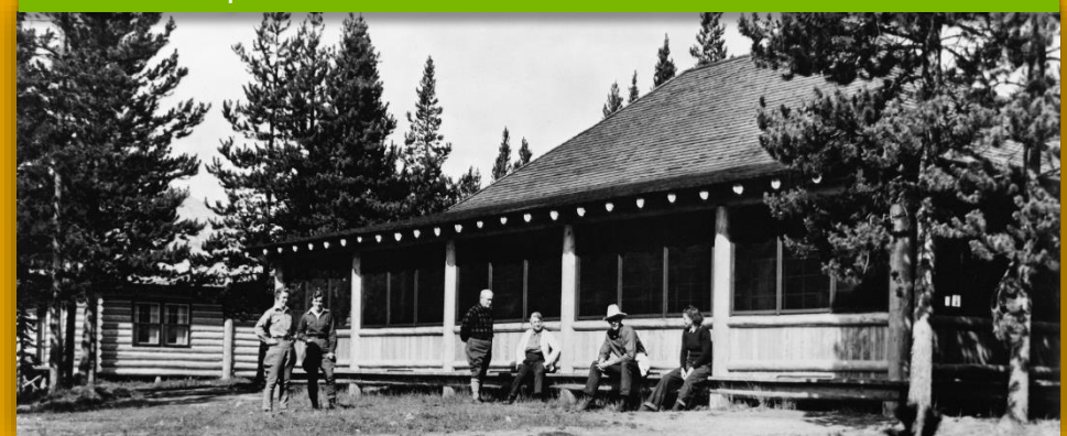
Designated a new National Historic Site, the Maligne Lake Chalet and Guest House, for its role in the early development of tourism in the mountain national parks.