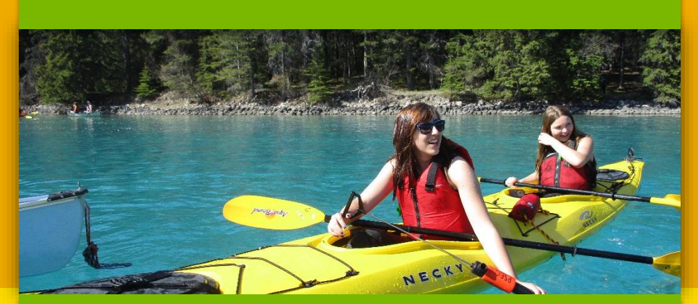
Increased enrolment in engaging youth stewardship programs at the Palisades Stewardship Education Centre.