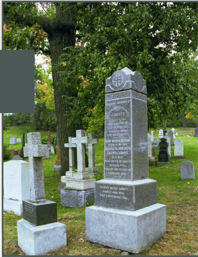
Born on March 12, 1821, Saint-André -Est, Quebec Died on October 30, 1893, Montréal, Quebec Buried at Mount Royal Cemetery, Montréal, Quebec