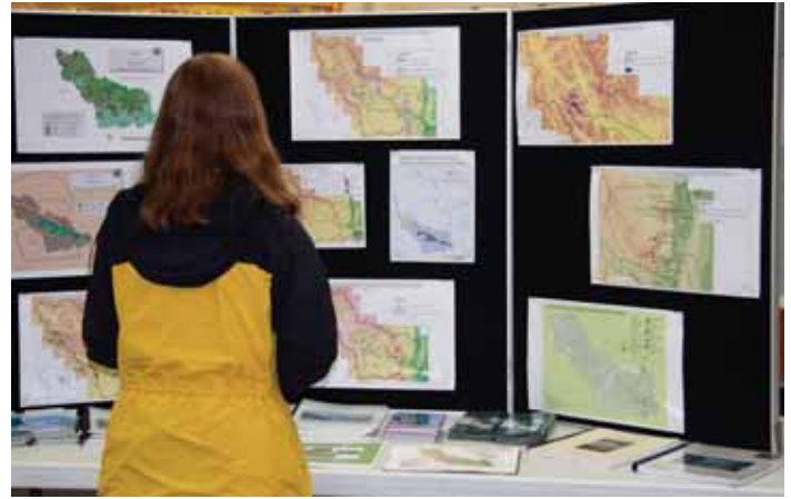
Open houses in Dehcho communities and Yellowknife were attended by many interested community members.