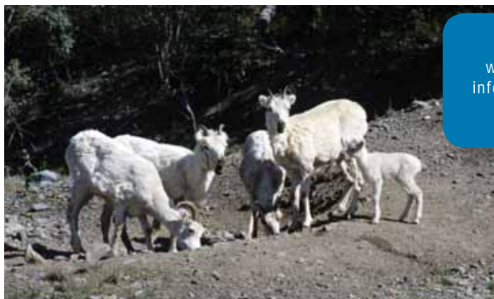
Dall's sheep at Prairie Creek mineral lick, June 2001. Photo: Douglas Tate, 2001

Local people and business owners need real information on what might be gained or lost economically before they can make informed decisions about whether or not they support an expansion. Member of the public, Fort Simpson