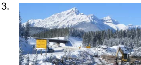
Tree clearing, Icefields Parkway Interchange

2. The August 2008 announcement of a $100 million investment from the Government of Canada's "Building Canada" infrastructure plan will enable twinning work to proceed on a 14 km section west of Castle Junction ( IIIB-2 ). Construction is set to begin this spring and will include fencing and 13 additional wildlife crossing opportunities (2 overpasses and 11 underpasses). When completed in 2011, the entire highway between Banff and Lake Louise will be four lanes.