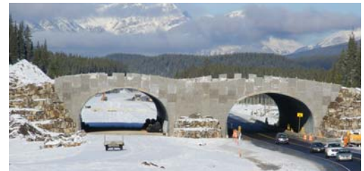
Wildlife overpass under construction west of Moraine Creek

1. The 9 km stretch of highway immediately east of Lake Louise ( IIIB-1 ) will be open for traffic by mid-summer 2009. The project is currently 90% complete. It includes twinning, fencing, construction of 5 highway bridges, a pedestrian underpass crossing and 6 wildlife crossing opportunities (2 overpasses and 4 underpasses). Both overpasses will be ready for use by the fall. Monitoring is already detecting use of the completed crossing structures by bears, wolves, moose, ungulates and even lynx!