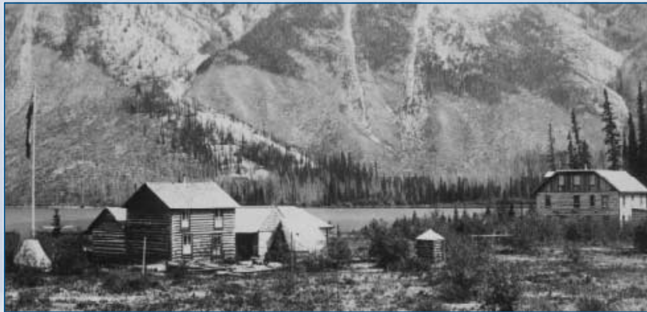
"Hotels" - Lake Minnewanka, 1890

Lake Minnewanka has a rich history. There are recorded archaeological sites showing pre-contact occupations that cover an entire 10,000 year period. Artifacts have been found from the early, middle and late pre-contact periods. The Minnewanka site is one of a series of such early sites in the lower Bow Valley. There are also historical sites like the old Cascade Power Plant and the submerged features of the Lake Minnewanka townsite - Minnewanka Landing.