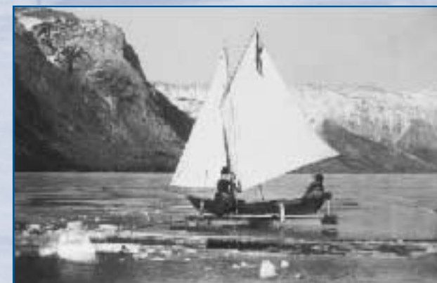
Ice boat on Lake Minnewanka, 1890

Please help us to protect this resource by minimizing your impact and reporting any vandalism to the Warden Service at 1-888-WARDENS (toll free)