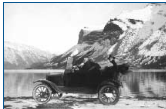
Car on Banff/Minnewanka Road, 1920

Cautions: Deeper areas for experienced divers only. To get from one pier to another, divers need to swim over deeper water - good buoyancy control is necessary to avoid going deeper.