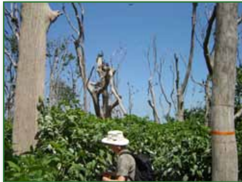
Nest counts, Middle Island.