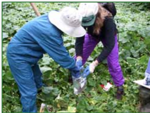
Collecting soil samples, Middle Island.