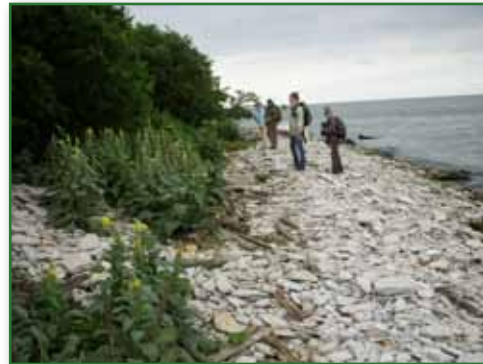
Research team, Middle Island.