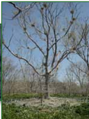
Vegetation destroyed at base of Blue ash tree, Middle Island.