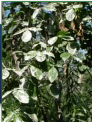
Common hop tree covered in guano, Middle Island.