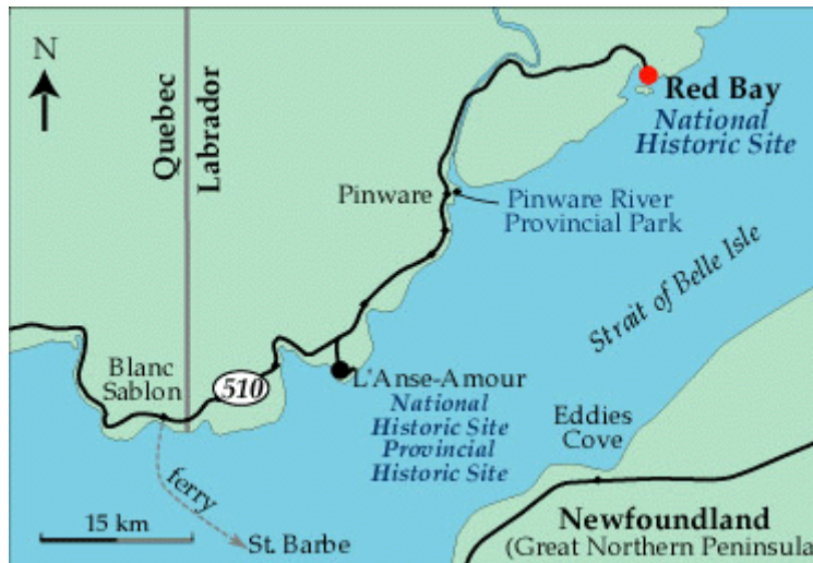
Map of the Red Bay area, Parks Canada

Red Bay is situated in the Labrador Straits region of Labrador - a part of the Canadian province of Newfoundland & Labrador. The Strait of Belle Isle separates the two parts of the province.