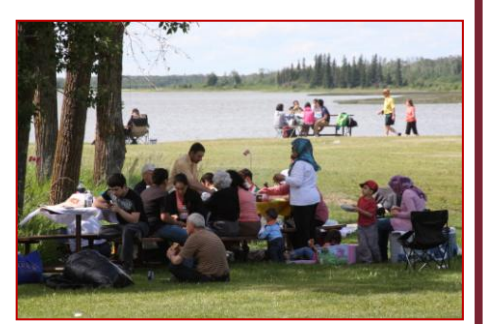
Picnicking on Sandy Beach

Elk Island is a founder and major supporter of the Beaver Hills Initiative, formed to create an ecological, social and economic sustainable Beaver Hills region through shared initiatives and coordinated action. The Initiative is a collaboration of municipal, provincial and federal governments, private land owners, non-government groups and industry. The Beaver Hills Initiative is in the process of nominating the Beaver Hills as a UNESCO Man and the Biosphere Reserve, with Elk Island as the main part of its protected core.