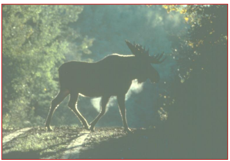
Bull Moose (Parks Canada)