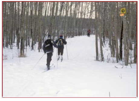
Cross-country Skiing (Parks Canada)