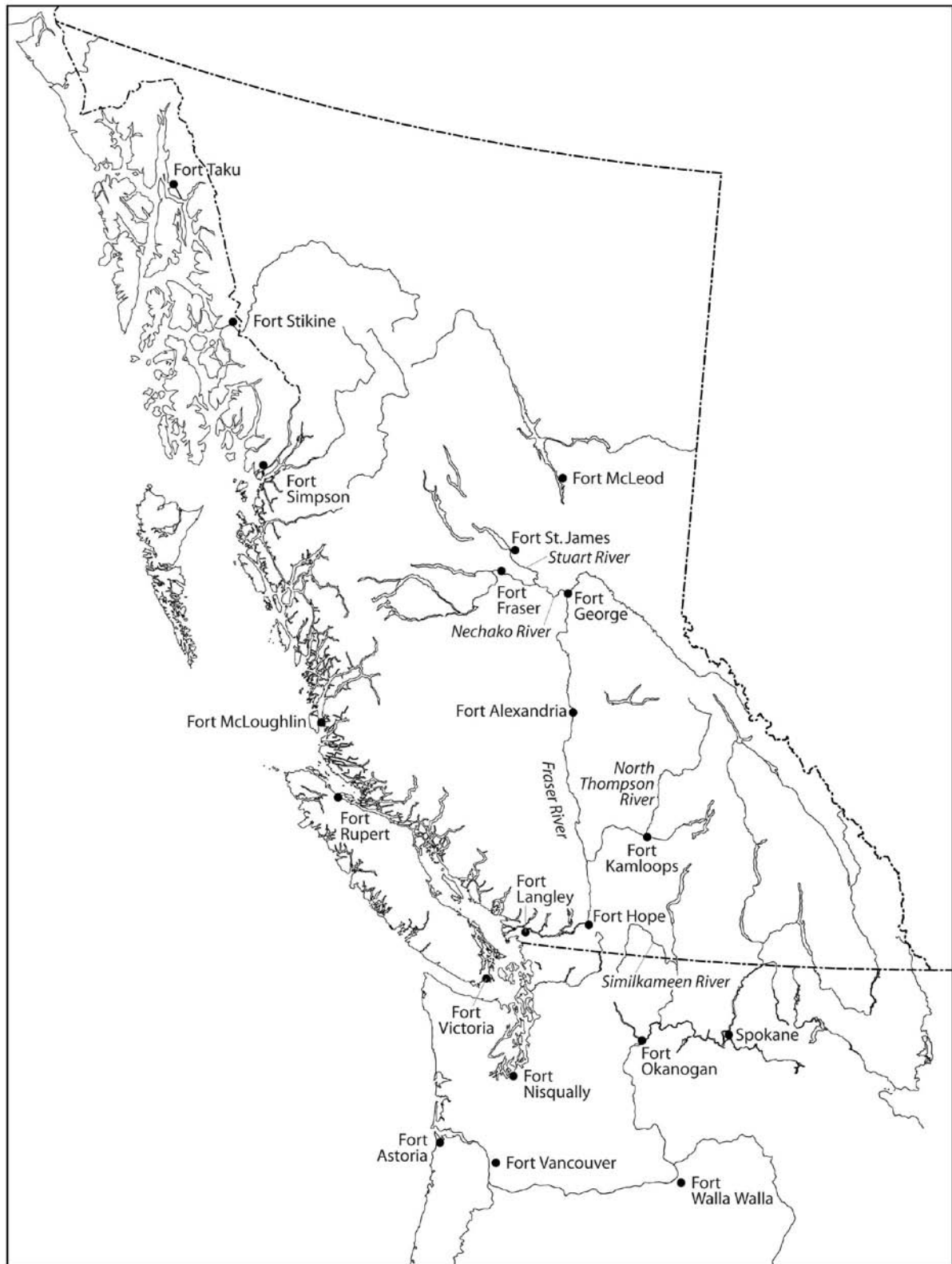
Hudson's Bay Company posts on the West coast, mid 1800s