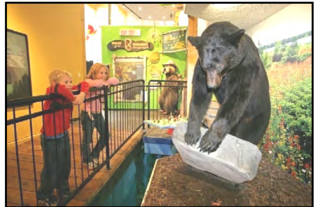
Photo: Kids admire the bear exhibit in the Visitor Centre.