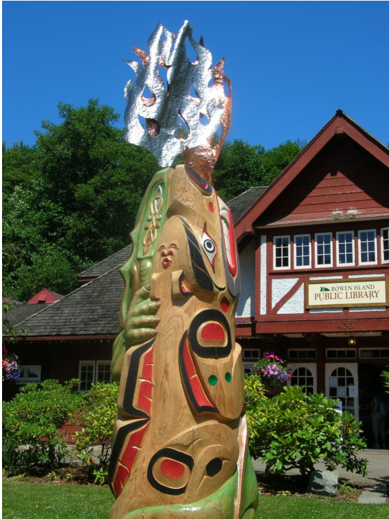
Bowen Island Public Library

Canada's relationship with Aboriginal peoples has been set out and defined by The Constitution Act, 1982 , legal statutes, and courts of law. Because of this relationship, Parks Canada considers Aboriginal peoples not as stakeholders but as unique partners. This has been demonstrated many times by the fact that over half of our national parkland is protected