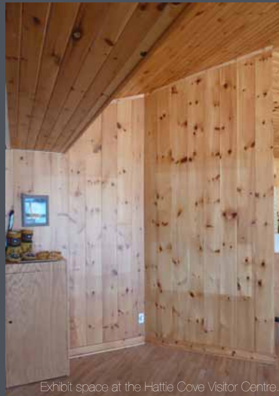
Exhibit space at the Hattie Cove Visitor Centre.

Each year, we have a small budget for basic art supplies, including pencils, black ink pens, erasers, paper, and some paint and art boards. If you'll require other art supplies, please contact us to discuss.