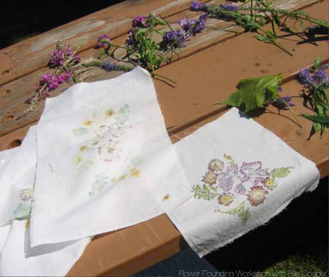
Flower Pounding Workshop with Ellie Cooper.