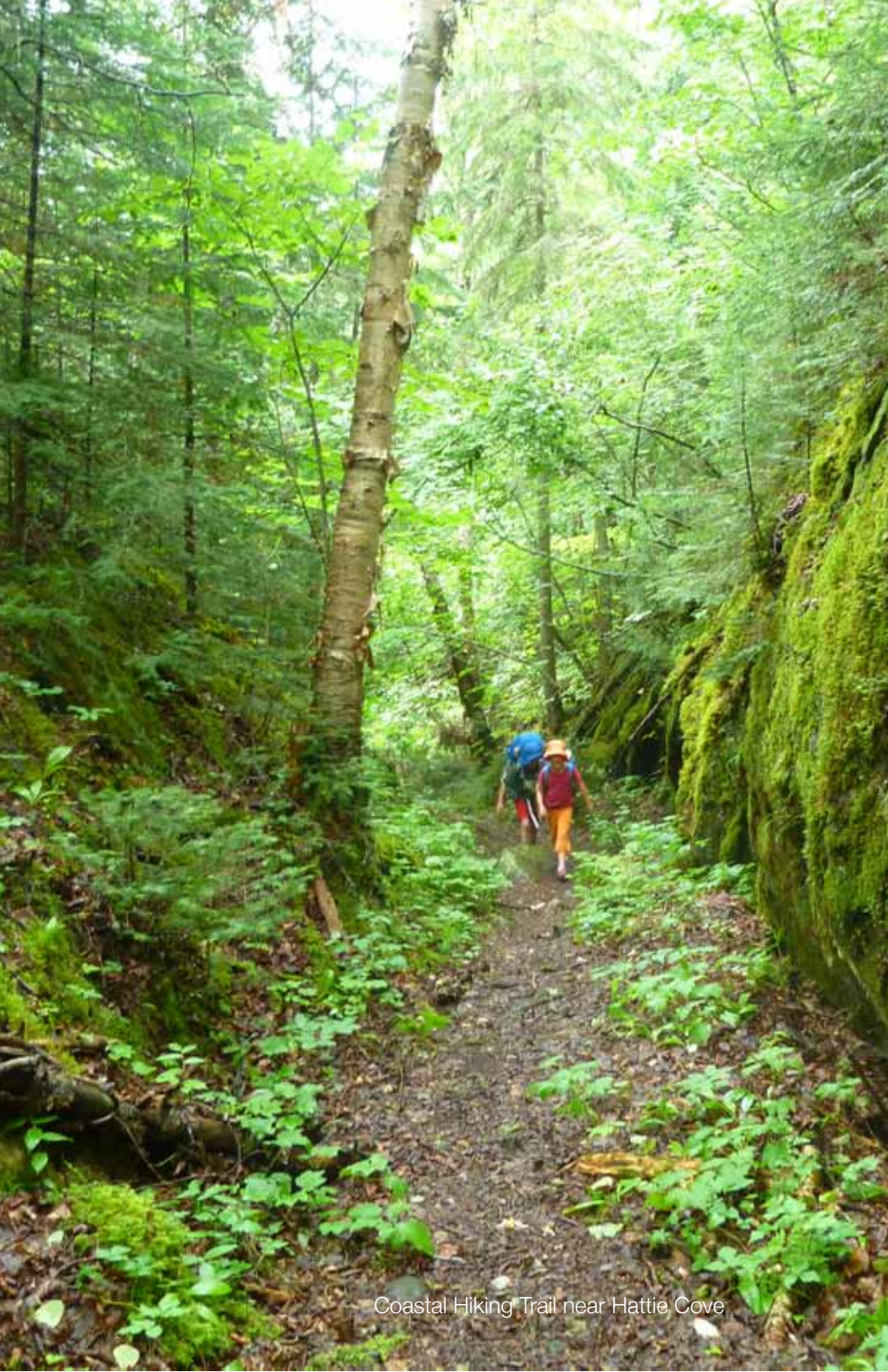
Coastal Hiking Trail near Hattie Cove