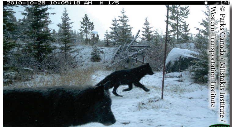
Wolves using wildlife overpass in Banff National Park

Wolves were on the move in Banff National Park in November. In a two week period, images of wolves were collected at six wildlife crossings on 11 different occasions.