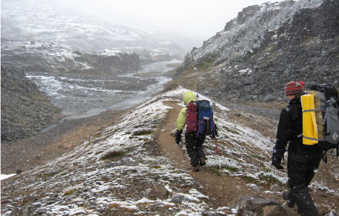
Hiking towards Happy Camp