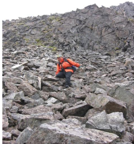
Descending the Pass

Hiking north to south you will be moving against the predominant flow of hikers and will encounter many more hikers along the Trail. Descending the steep incline from the Pass to the Scales, while easier on the respiratory system, places greater stress on knee and ankle joints and puts you at greater risk of losing your footing, falling and possibly injuring yourself.