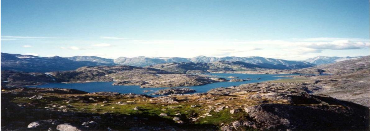
View from the Chilkoot Pass overlooking Crater Lake

The Chilkoot Trail is isolated, strenuous, physically challenging and potentially hazardous. The trail is also extremely rewarding, providing hikers with spectacular scenery within a unique historical setting.