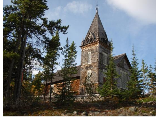
St-Andrew's Church at Bennett

Over this trail, thousands of goldseekers trekked en route to the Klondike goldfields irrevocably establishing a non-native presence in the territory. Prior to, as well as during the Gold Rush, this route was also an important trade and travel link for First Nations.