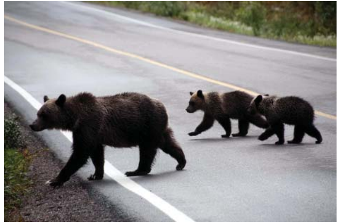
Grizzly bear 72 is an expert at living on the edge: she has learned to use habitat on the fringes of Lake Louise that sustains her and her offspring.

Lake Louise is a core area for female grizzly bears. Their survival is important to the health of the regional grizzly bear population.