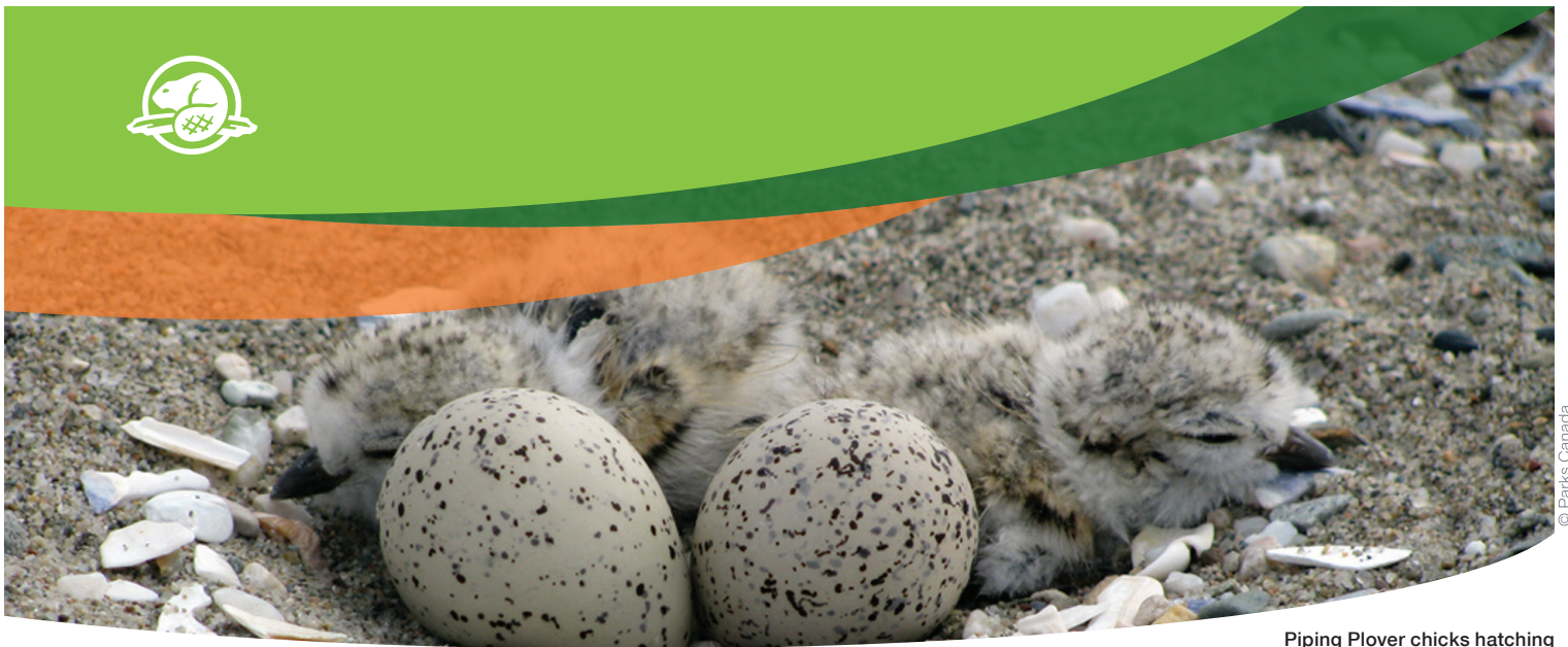
Piping Plover chicks hatching